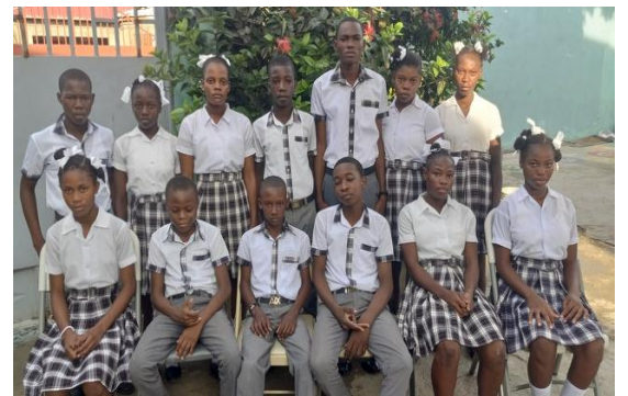
13 Vocational students, HEM supports, who are learning a trade

May the good Lord be with you, Esther Petit-frère