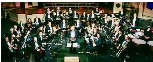
Syracuse University Brass Ensemble