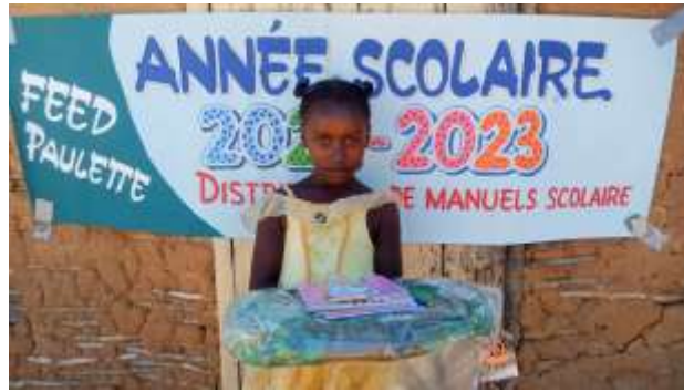
One of our 100 supported Haitian students